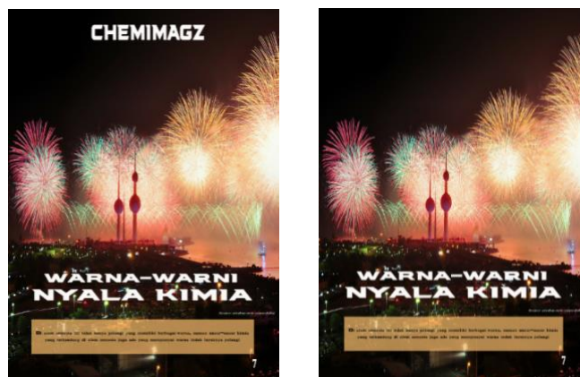
Figure 4. Main presentation page of colorful chemical flame after revision

The revision on the main presentation page of the colorful chemical flame lies in the title of the chemimagz magazine which initially contained the name of the magazine, but after the revision, the name of the magazine was deleted.