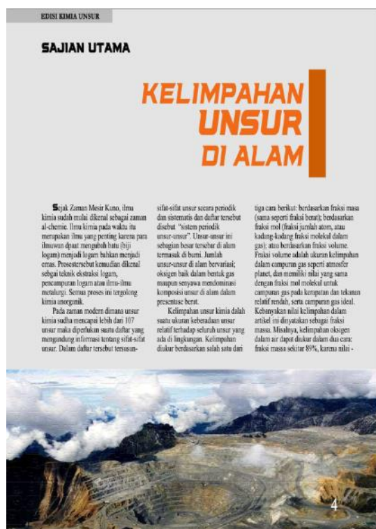
Figure 1. The result of the Chemimagz magazine design on the main presentation page

The results of this learning media design research produced chemistry learning media in the form of Chemimagz Chemistry magazine. This product design explains the explanation of elemental chemistry material presented through facts and everyday examples. The product of this research produces magazine media in the form of printed magazines. The resulting print media is a chemistry magazine consisting of a front cover, editorial greetings, table of contents, magazine contents containing content, and back cover, and the results of the initial design of this design in the form of Draft I of chemical media. The display of the chemicals magazine-making process can be seen in Figures 1 and 2.