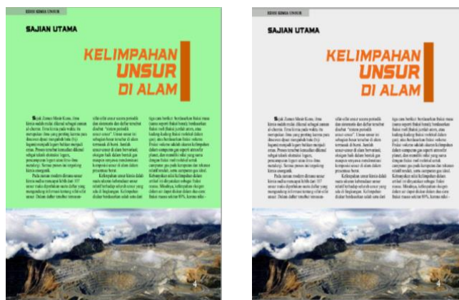
Figure 3. Element abundance main presentation page after revision